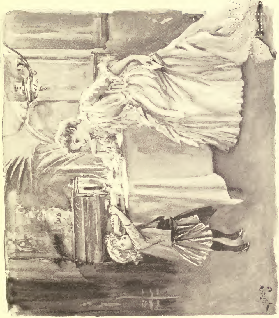
HIS INITIAL ACT OF CHARITY : " LADY," HE SAID, " LADY, F'ONT DOOR—WANT BEAD "